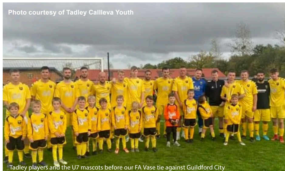
Tadley players and the U7 mascots before our FA Vase tie against Guildford City