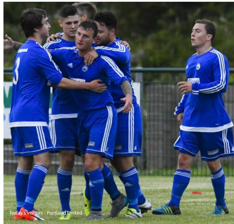
Today's visitors - Portland United