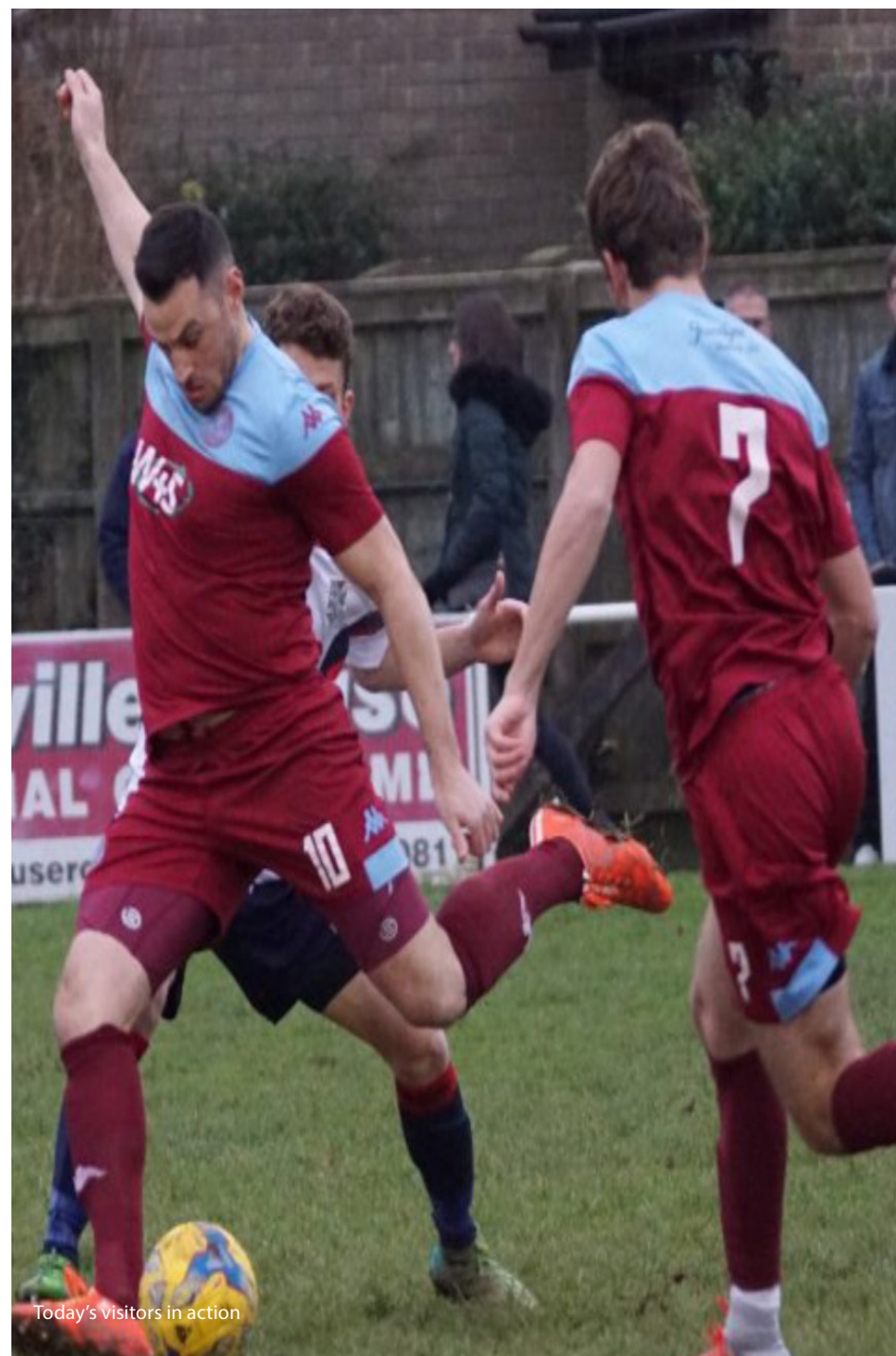
Today's visitors in action

FOR MORE INFORMATION PLEASE CALL 07500703112 (ALAN HIBBS) OR 07990517802 (SANDY RUSSELL)