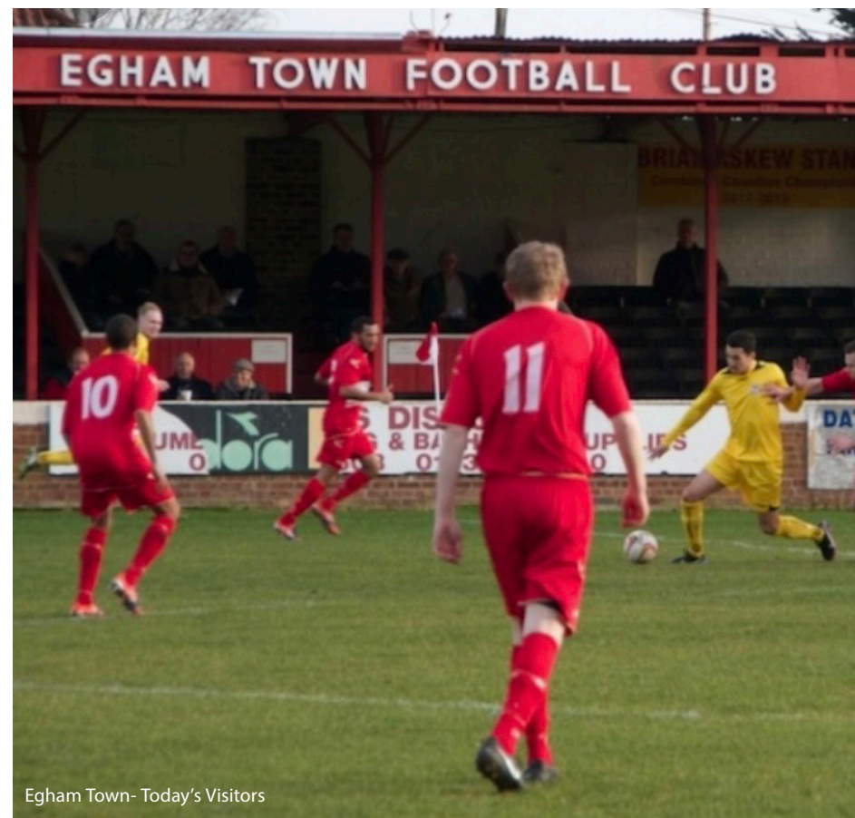
Egham Town- Today's Visitors