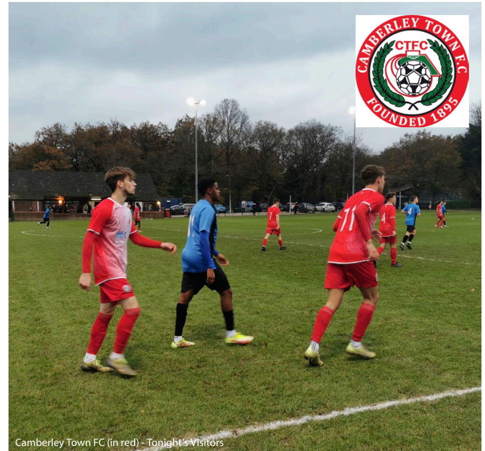
Camberley Town FC (in red) - Tonight's Visitors