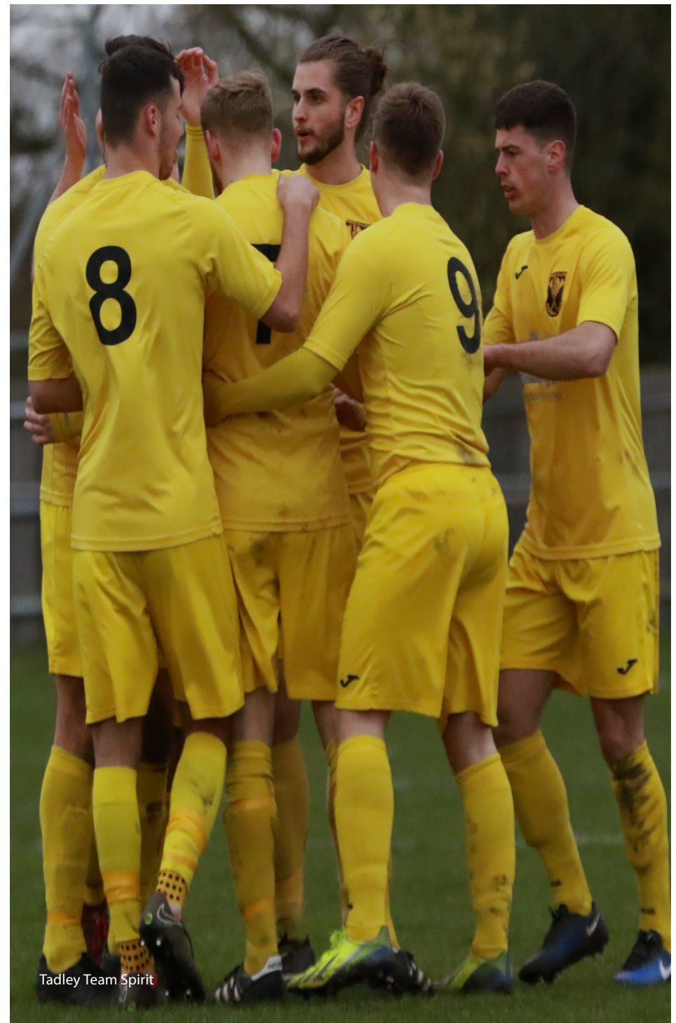
Tadley Team Spirit