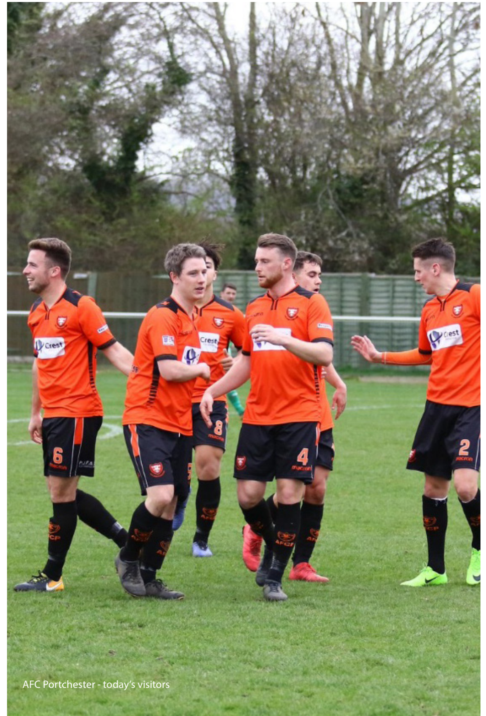
AFC Portchester - today's visitors