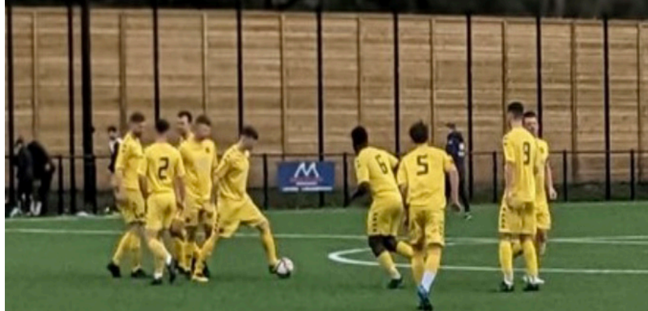
Tadley Calleva warming up before the match against Badshot Lea