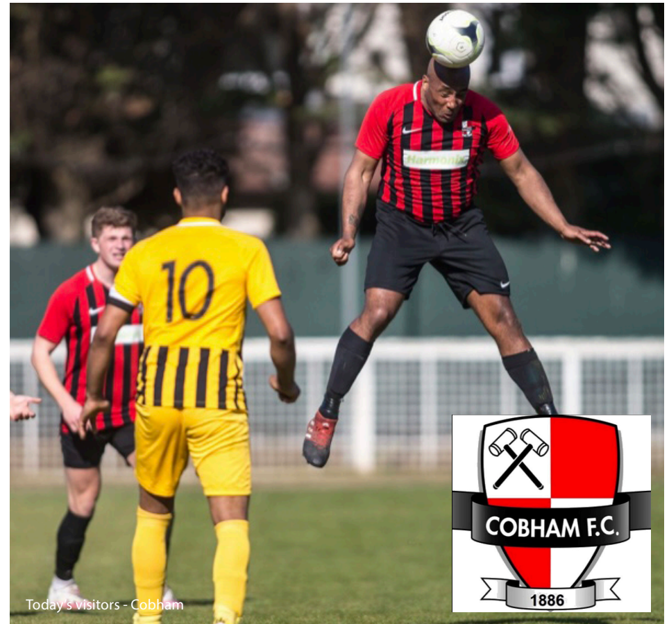
Today's Visitors - Cobham