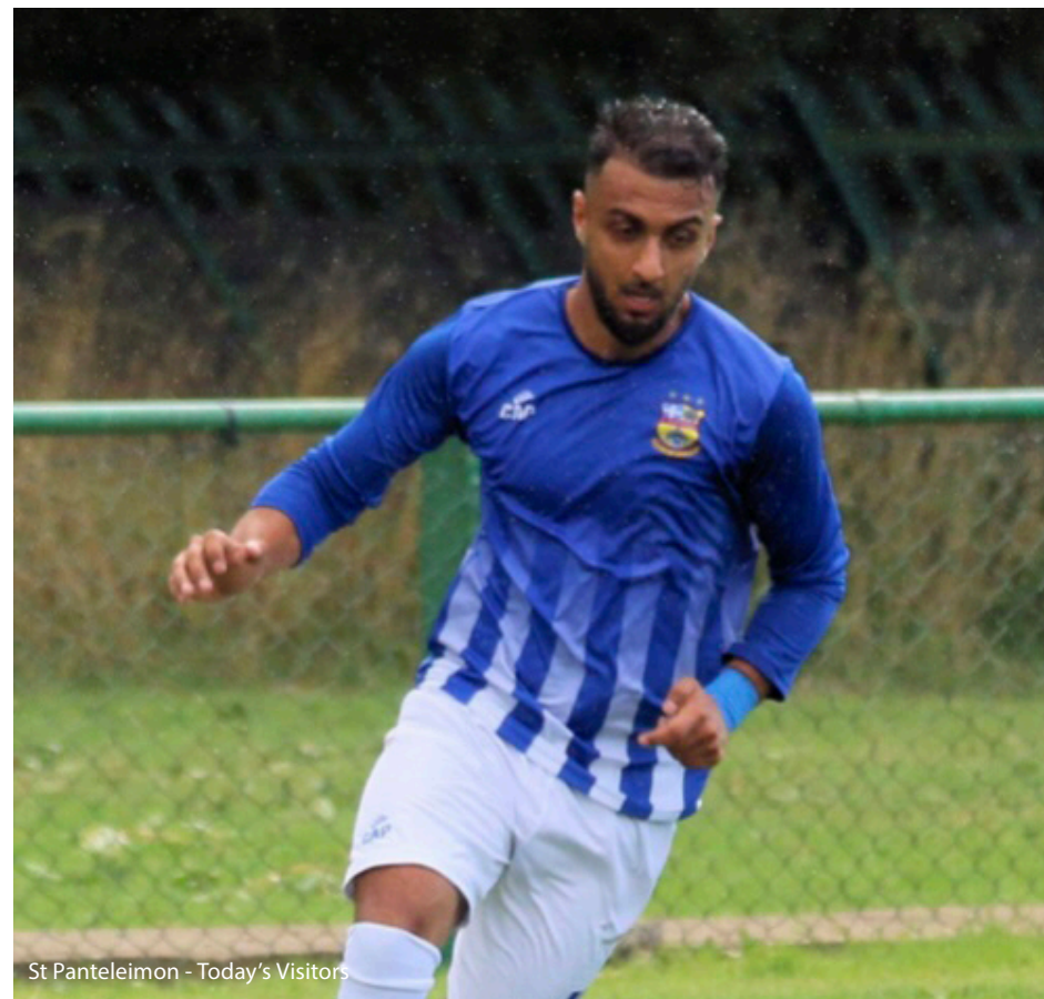
St Panteleimon - Today's Visitors