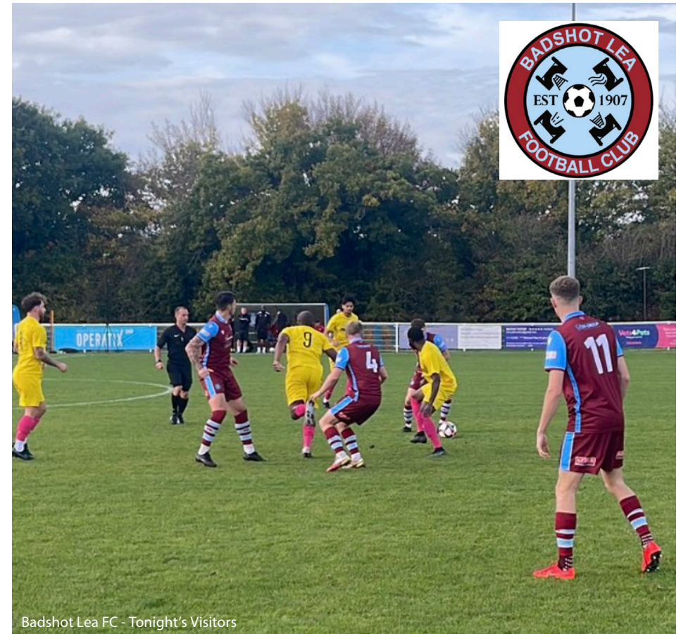
Badshot Lea FC - Tonight's Visitors