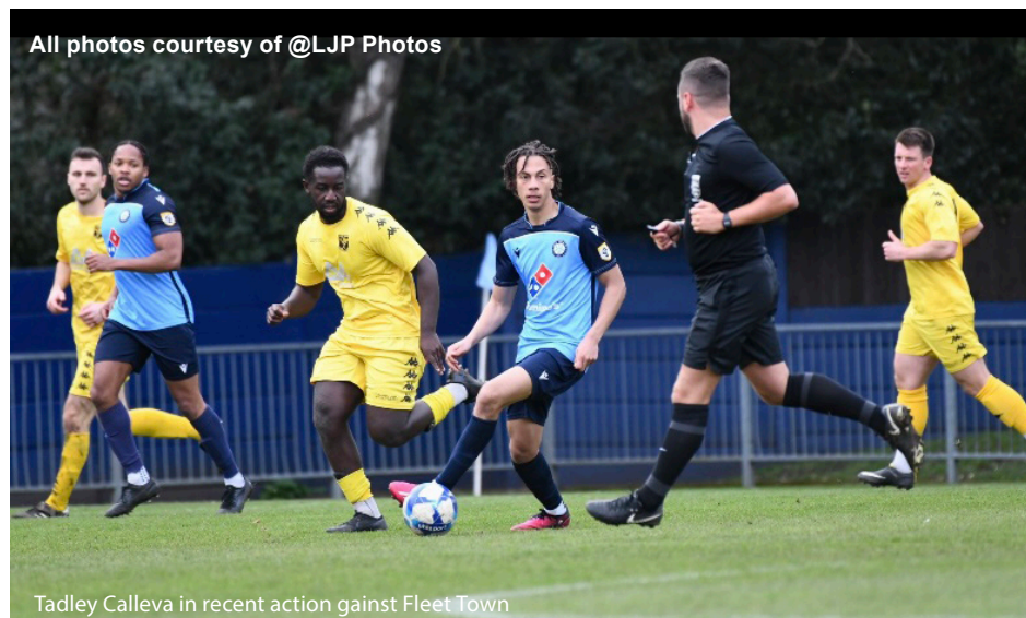
Tadley Calleva in recent action against Fleet Town