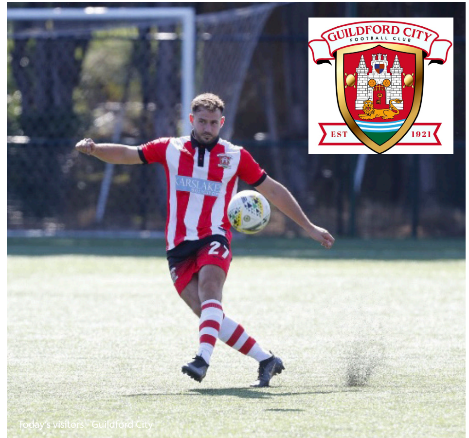
Today's visitors - Guildford City