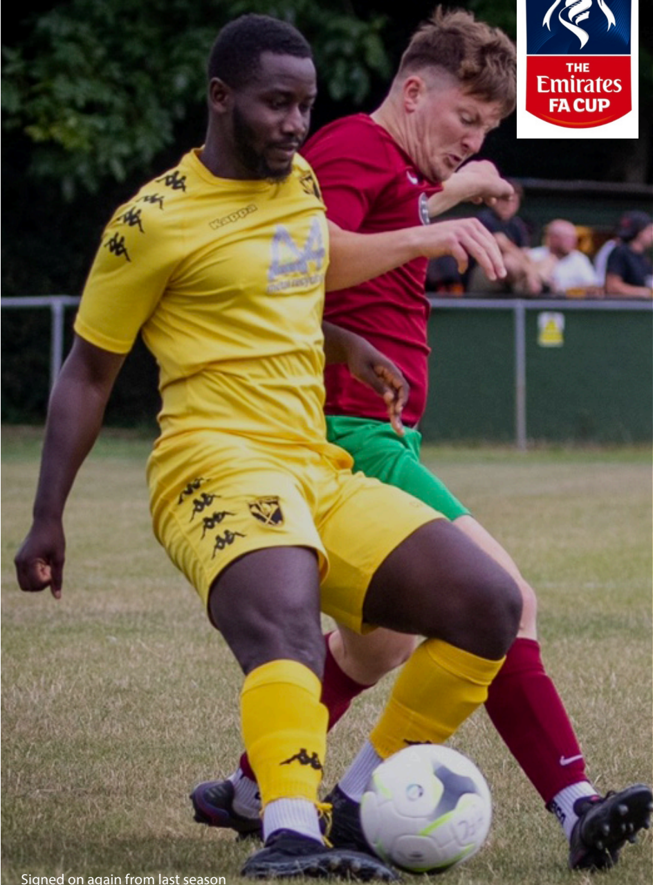
Signed on again from last season