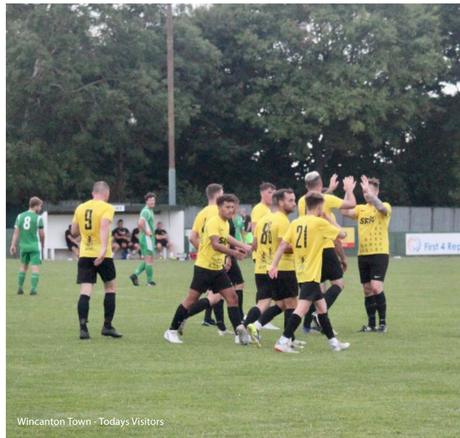
Wincanton Town - Todays Visitors