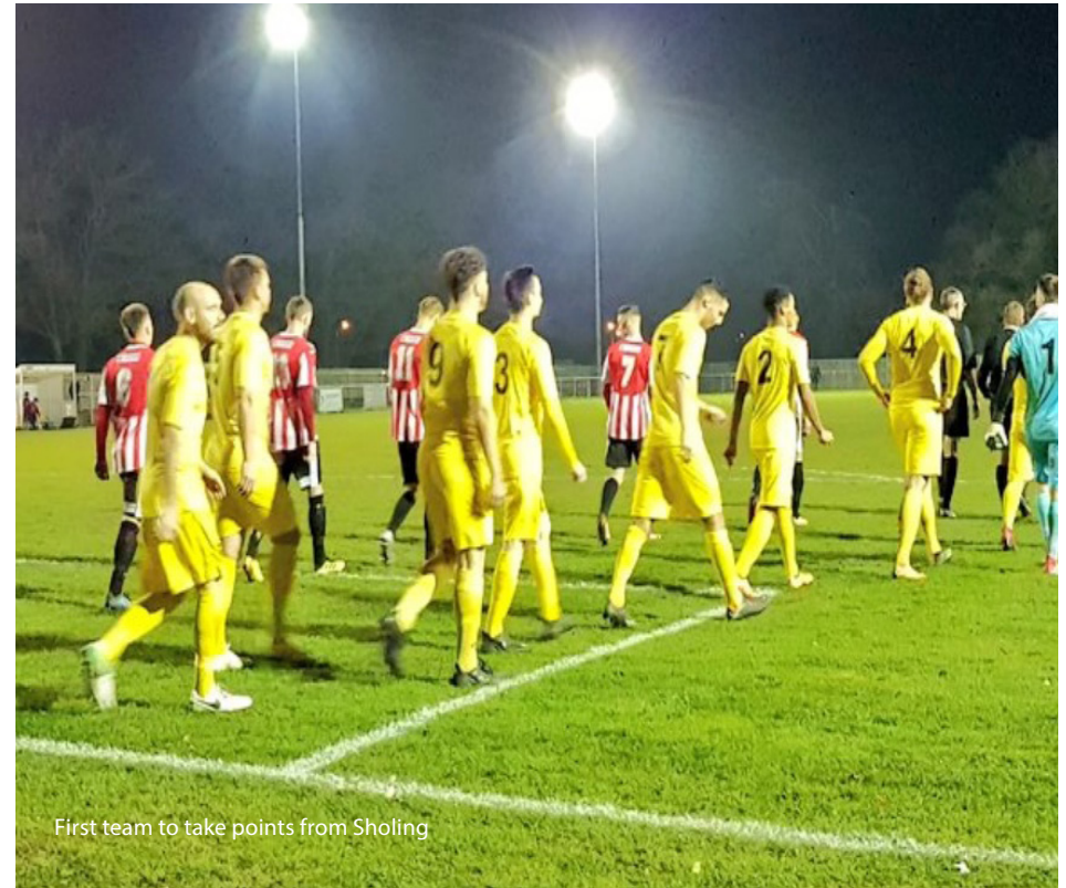
First team to take points from Sholing