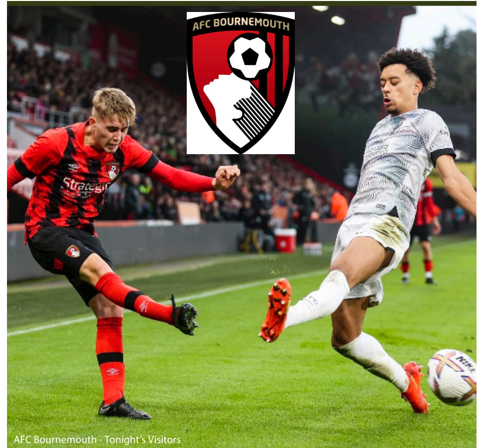
AFC Bournemouth - Tonight's Visitors