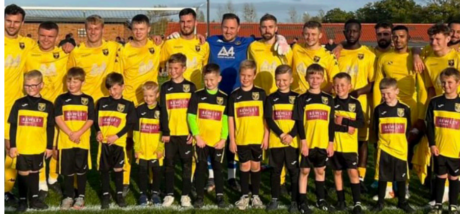
Tadley Calleva first team squad and the U8 mascots