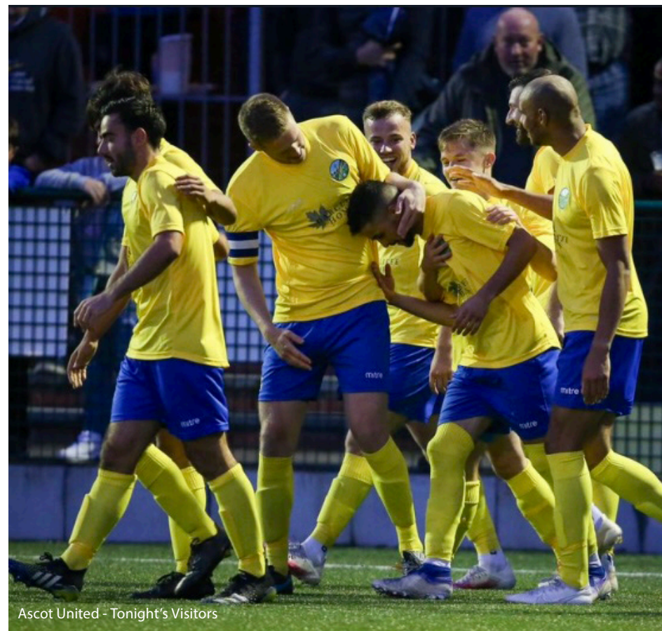
Ascot United - Tonight's Visitors