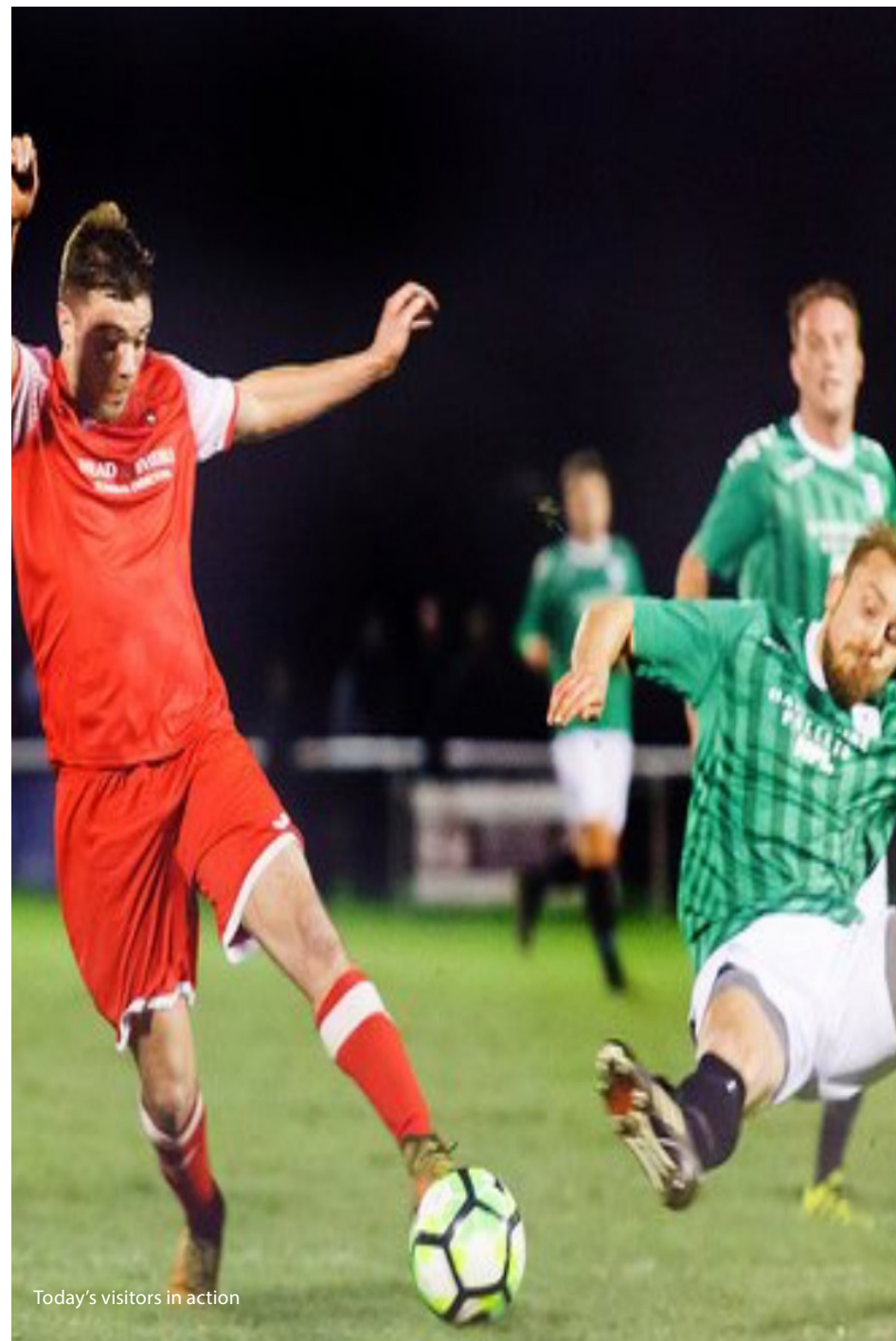
Today's visitors in action

FOR MORE INFORMATION PLEASE CALL 07500703112 (ALAN HIBBS) OR 07990517802 (SANDY RUSSELL)