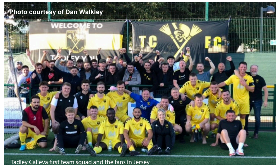
Tadley Calleva first team squad and the fans in Jersey

The club achieved its ambition of gaining promotion to the Wessex League Premier Division last season - the highest level (Step 5) that the club has competed at. The goal is to consolidate its position on the field and to make significant progress with the infrastructure off the field.