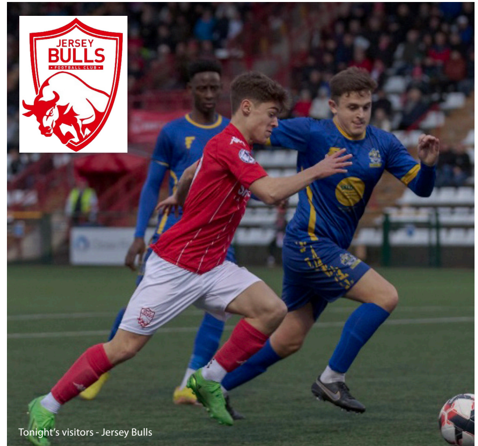
Tonight's visitors - Jersey Bulls