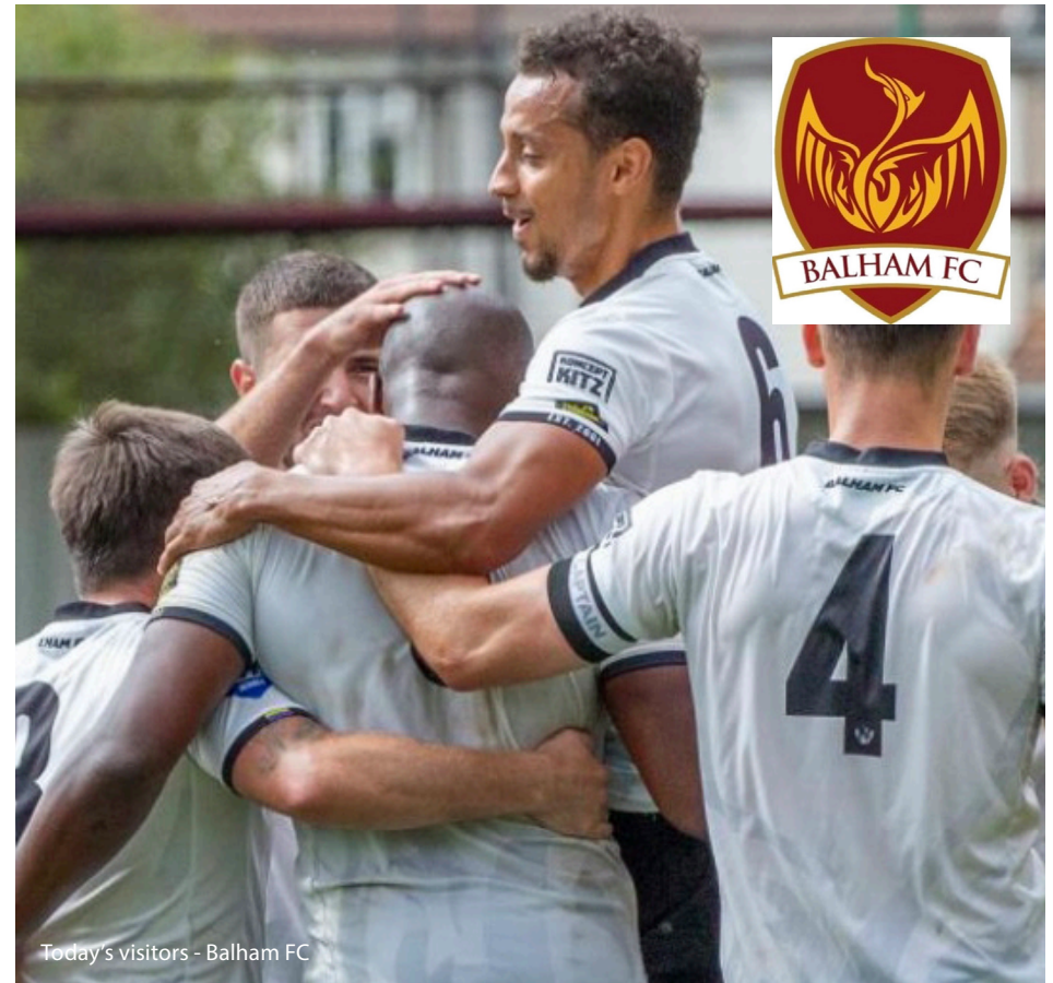
Today's visitors - Balham FC