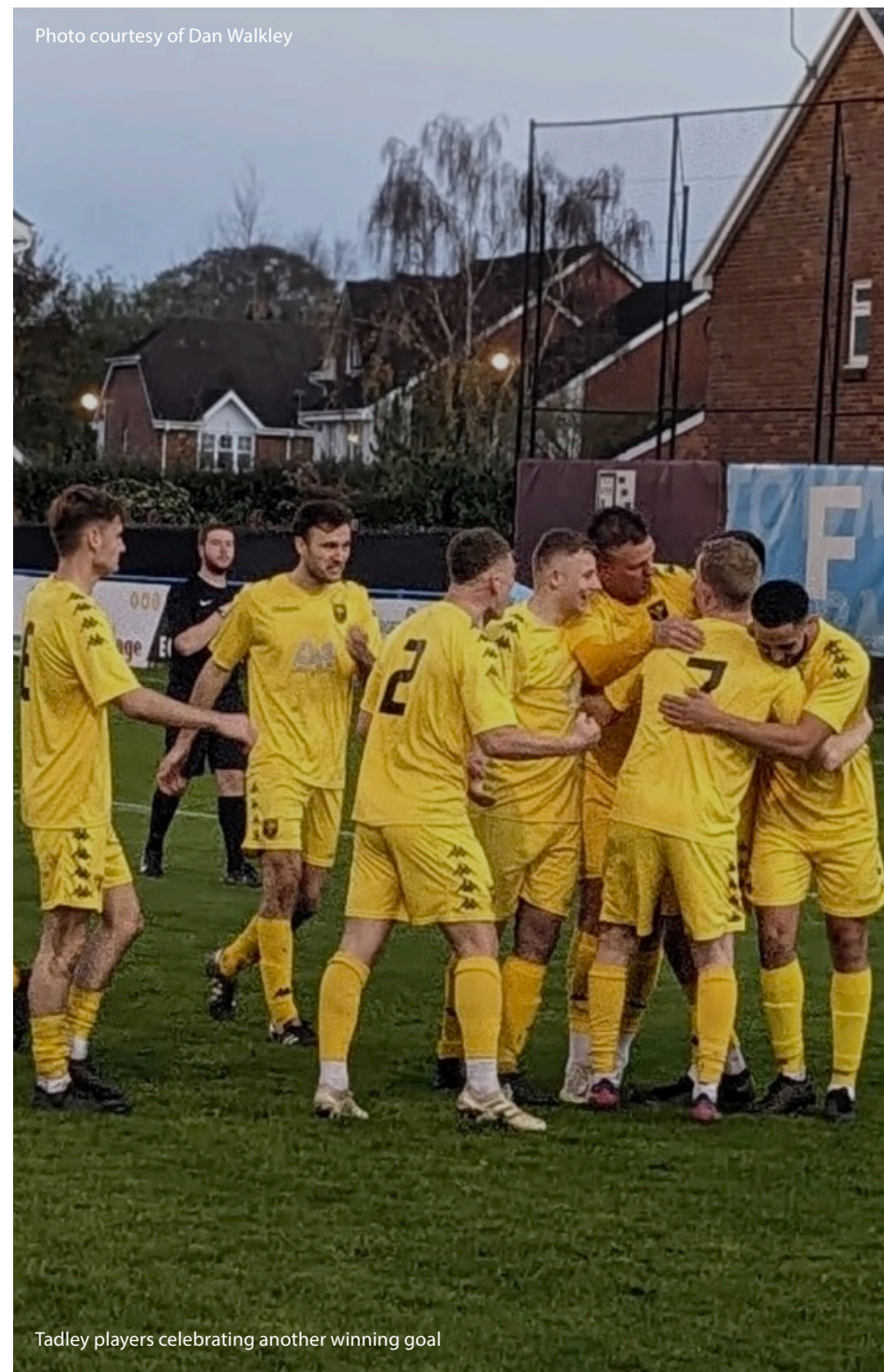
Tadley players celebrating another winning goal